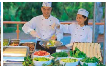
The Baharat Bazaar